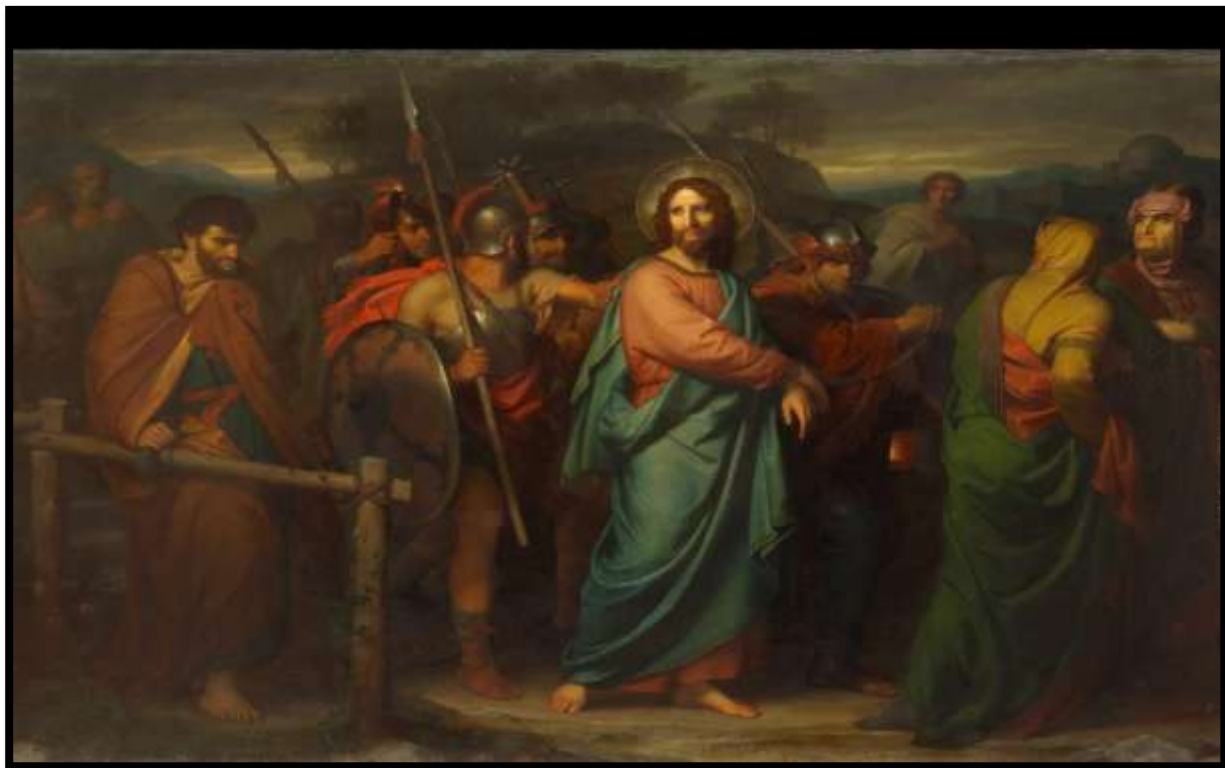
“The Capture of Christ”, Heinrich Hofman, 1858

Our Good Friday service will be offered April 3 rd at 10 a.m. This is a solemn worship service of readings, prayers and reflection. The story of the passion of Christ will be proclaimed, our hope in Easter's promise of new life remembered. The service is not funereal but more of a quiet celebration of God's good news of salvation through the paradoxical suffering and death of our Lord Jesus Christ. The service concludes quietly with worshippers departing without socializing or gathering.